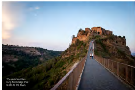
The quarter-mile-long footbridge that leads to the town.