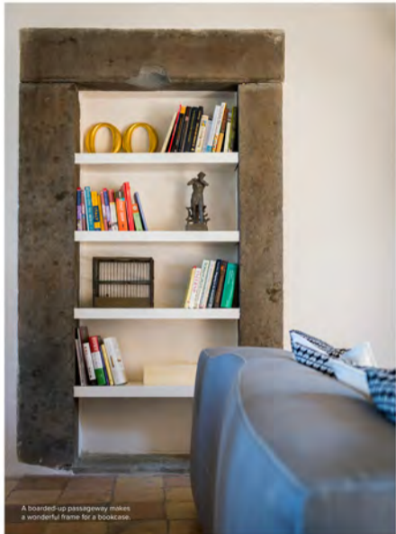
A boarded-up passageway makes a wonderful frame for a bookcase.