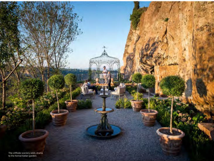
The cliffside scenery adds drama to the formal Italian garden.