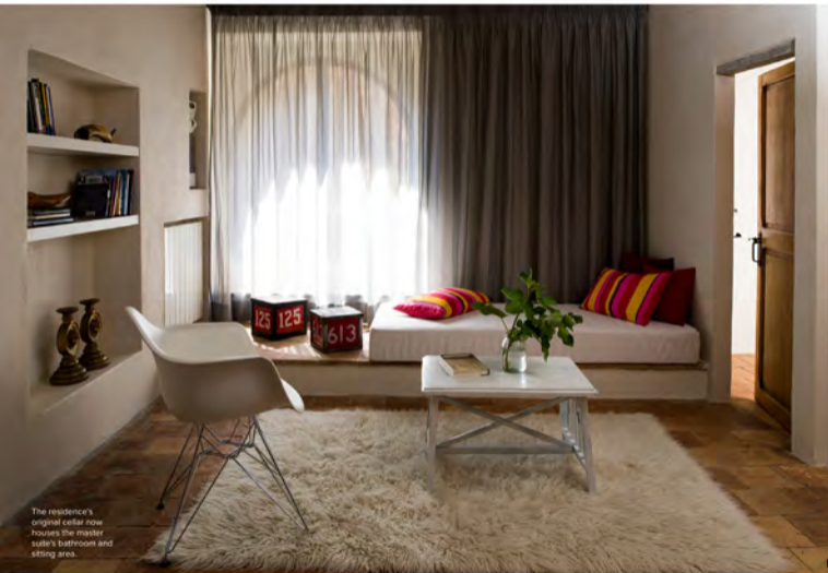
The residence's original cellar now houses the master suite's bathroom and sitting area.