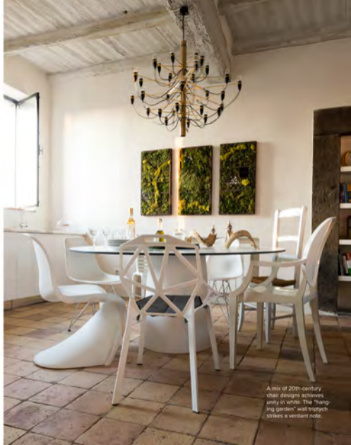
A mix of 20th-century chair designs achieves unity in white. The "hanging garden" wall triptych strikes a verdant note.