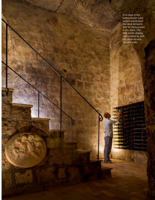
One area of the subterranean cave system possessed the ideal temperature for storing wine in the open. The 400-bottle display was created by drilling metal dowels into the walls.