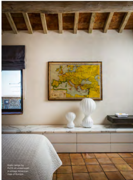
Getto lamps by FLOS sit underneath a vintage American map of Europe.